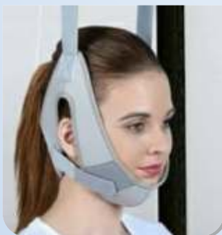
Traction Support Ref. Code : PT- 02