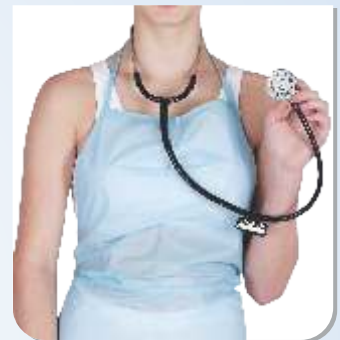
Stethoscope Ref. Code : DX-01