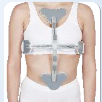
Ash Brace Ref. Code : A-4