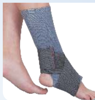
Ankel with Binder Ref. Code: AWB-31