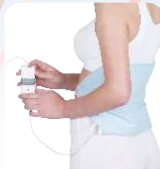
Heating Pad Ref. Code : HPX-01