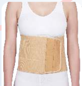
Abdominal Belt Ref. Code : B-508