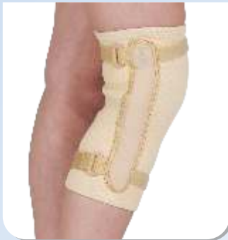
Knee Cap Hinged Ref. Code : H-01