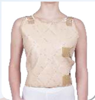
Chest Guart Ref. Code : CG-01