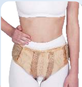
Hernia Belt Ref. Code : A-506