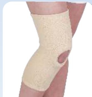
Knee Cap Open Patela Ref. Code : KCP-011