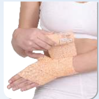
Craft's Wrap Ref. Code : CR-01