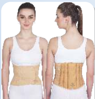
Lumbar Sacro Belt Ref. Code : B -513