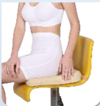
Cocrex Support Ref. Code : CP- 01