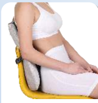
Back Rest Ref. Code : DB -01