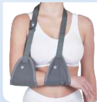
Arm Strap Ref. Code : AS-01