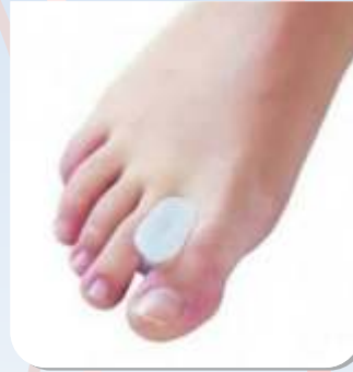
Toe Support Ref. Code : TO-01