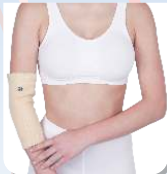
Tubular Elbow Support Ref. Code : TE-012