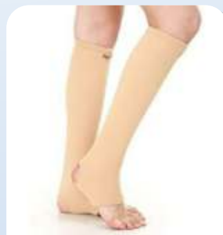
Vernicose Vein Below Knee Ref. Code : VV-01