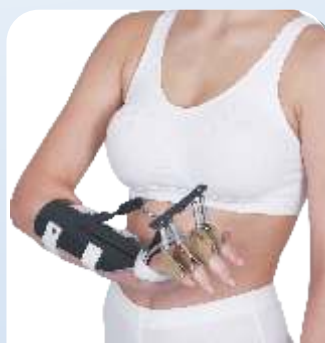
Dynamic Cocup Ref. Code : A-536