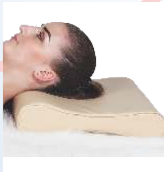
Contoured Pillow Ref. Code : 523