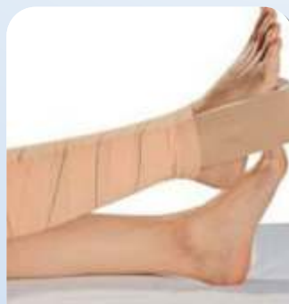
Leg Traction Ref. Code : LT -01