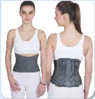
LS Contoured Belt Ref. Code : A-514