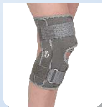
OA Knee Support Ref. Code : OA-01