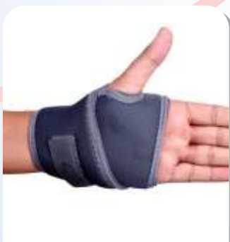
Drytex Thumb Support Ref. Code : NM -10