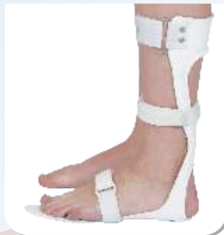
Foot Drop Splint Ref. Code : FD-02