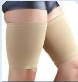
Thigh Support Ref. Code : 021