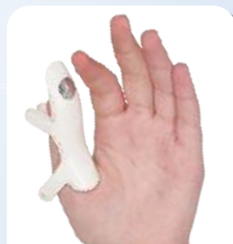
Frog Splint Ref. Code : F-02