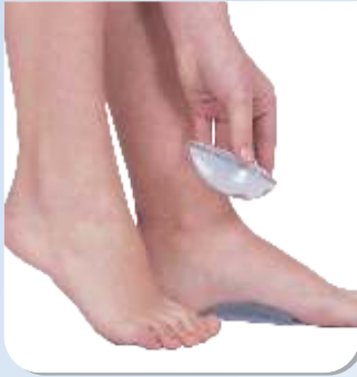
Arc Support Ref. Code : AR-01