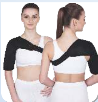
Shoulder Support Ref. Code : SS-553