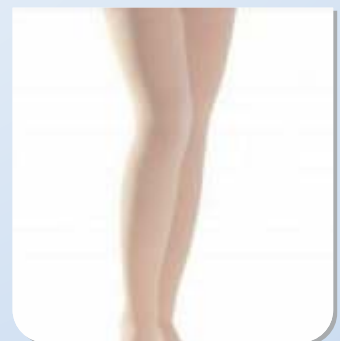
Vernicose Vein Above Knee Ref. Code : VV-02