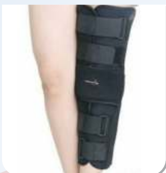
Knee Immbolizer Long Ref. Code: A-541