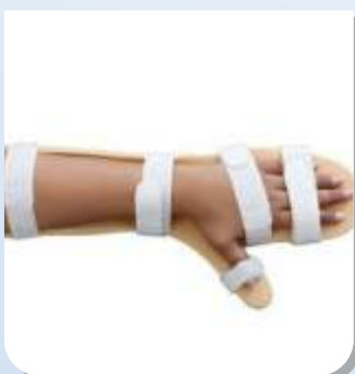
Static Cocup Ref. Code : B-536