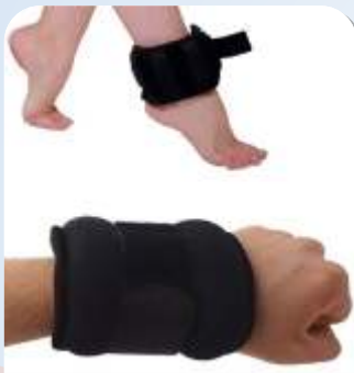
Weight Cuff Ref. Code : A-536