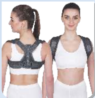
Clavical Brace Ref. Code : CB-33