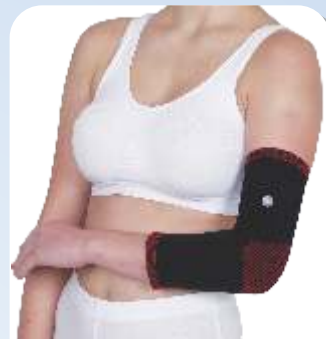
Tubular Elbow Support Deluxe Ref. Code : TE -012