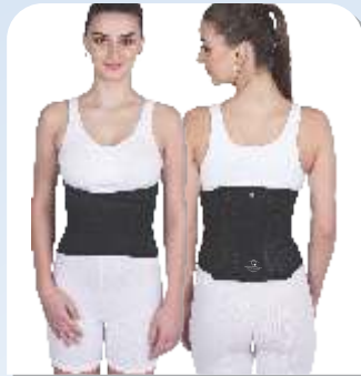
Corset Belt Ref. Code : B-514