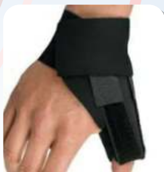
Thumb Support REF. Code : N-10