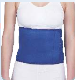
Neo Abdominal Belt Ref.Code: A-508