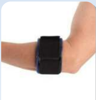
Tennis Elbow Support Ref. Code : 012