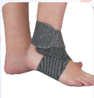
Ankle Binder Ref. Code : AB-32