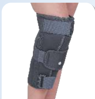
Knee Immoilizer Short REF. Code: 541