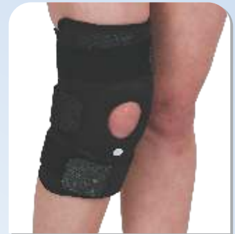
Functional Knee Support Ref. Code : 530