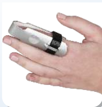
Finger Splint Ref. Code : F-07