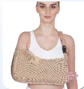
Arm Sling Pouch Adjustable Ref. Code : B-551