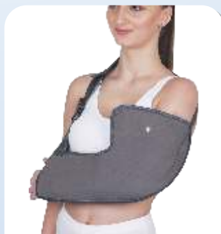
Arm Sling Pouch Ref. Code : A-551