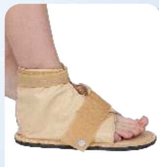
Cast Shoes Ref. Code : F-02