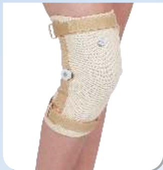
Hinged knee Support Ref. Code : HK-01