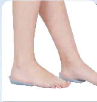
Heel Cushion Ref. Code : B-1