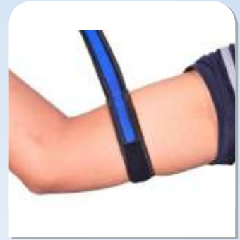
Torni Kit Ref. Code : TK-01