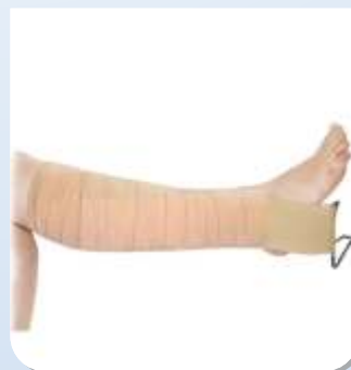
Skin Traction (Puff Liner) Ref. Code : ST- 01