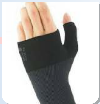
Neo Thumb Support Ref. Code : NM-10