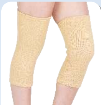
Knee Cap Support Ref. Code : 546