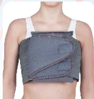
Chest Binder Ref. Code : GS-01