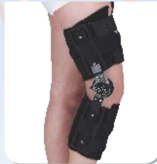
Rom Brace Ref. Code : ROM-1