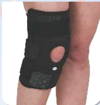
Elastic Knee Support Ref. Code : EKS-034