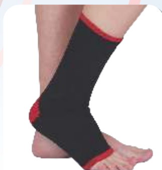
Anklet Support REF. Code: A-547