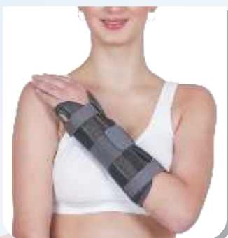
Wrist Splint Ref. Code : WA -02