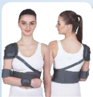
Elastic Shoulder Immbolizer Ref. Code : SE-01