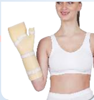
Hand Resting Ref. Code : H-02