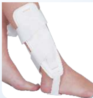
Ankle Brace Ref. Code : AB-15