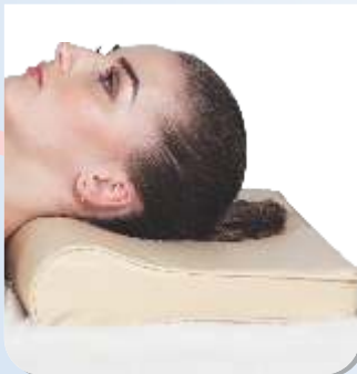
Cervical Pillow Ref. Code : 522