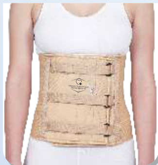
Pelvic Traction Belt Ref. Code : PT- 01