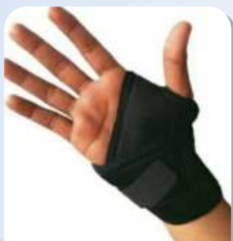
Wrist Binder REF. Code : N-09