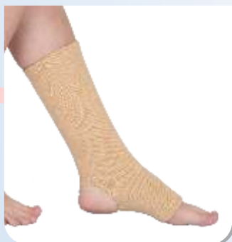
Anklet Support Ref. Code : 547