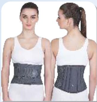
Lumbar Sacro Belt REF. Code: A-513