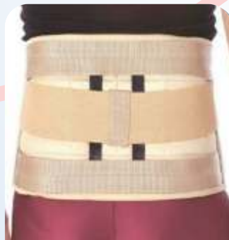
LS Eco Frame Ref. Code : EF-01