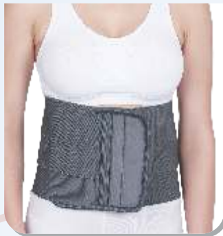
Abdominal Belt Ref. Code: 508