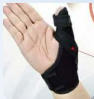
Thumb Spica Ref. Code : TS-030